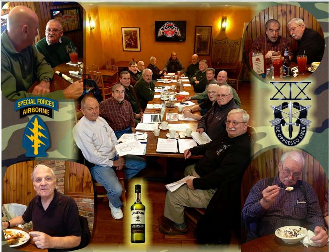
Chapter Meeting 20 NOV 16.